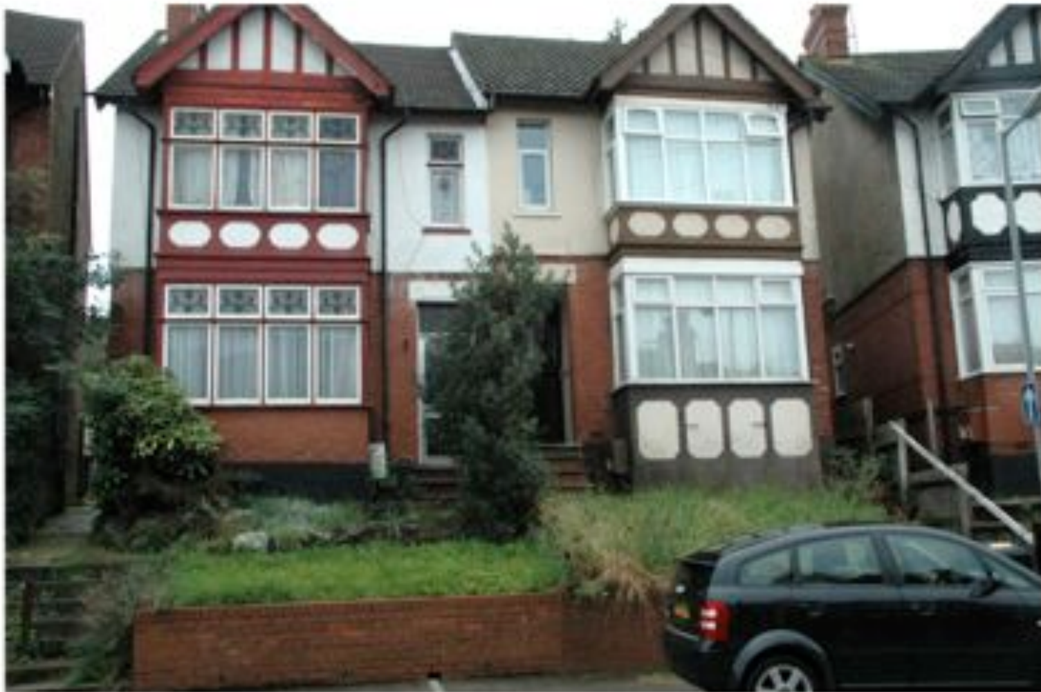
51 Russell Rise (17/9/2008)