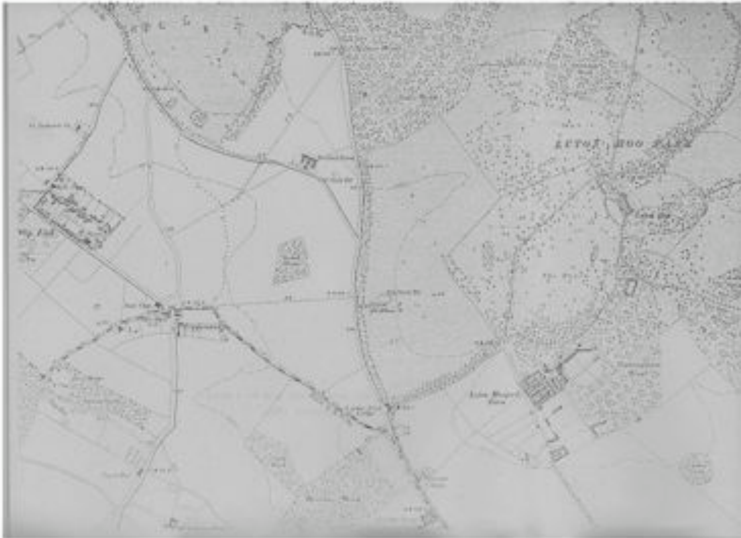
Ordnance survey map 2nd ed. 1901 showing hamlets of Slip End & Pepperstock and Luton Hoo. Gibraltar Cottage east of Heavens Wood (bottom of map) - James Perry & family lived here 1881-98.