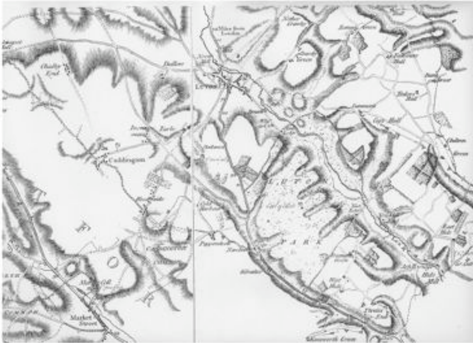
Extract from Jeffery's Map (1765) of Bedfordshire showing Caddington and its hamlets and Luton Hoo (Earl of Bute). Gibraltar Cottages south east of Pepperstock.