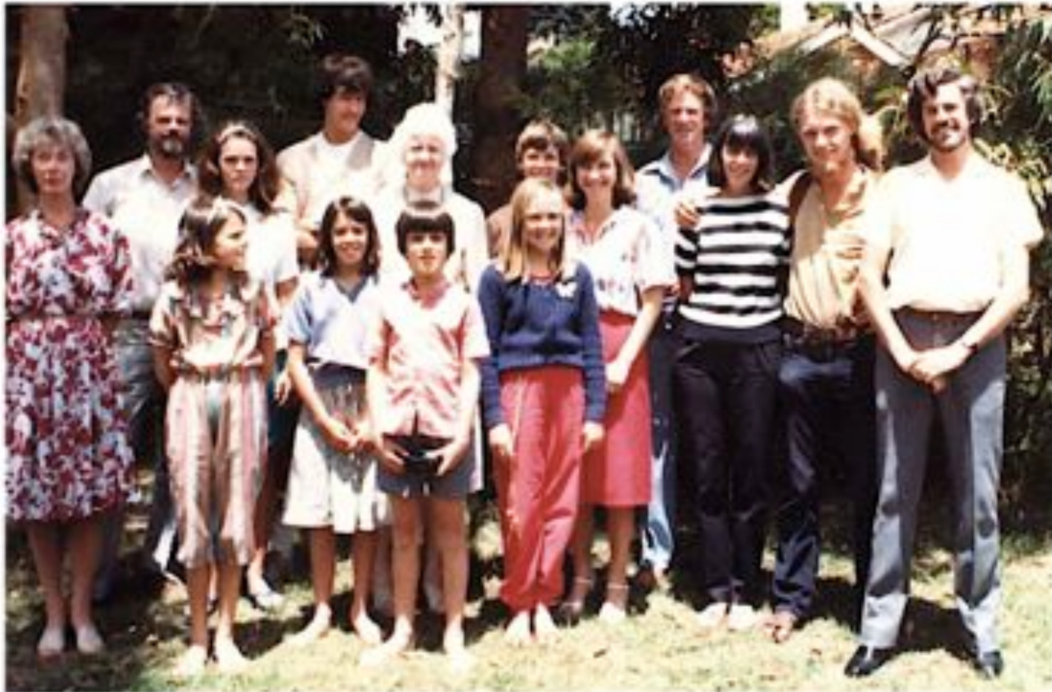
Taken around 1982