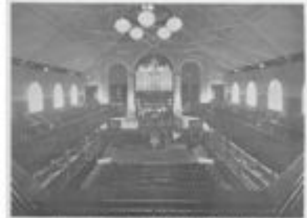
Interior view of Park Street Baptist Church, Later