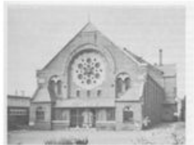
Park Street Baptist Church, 1974