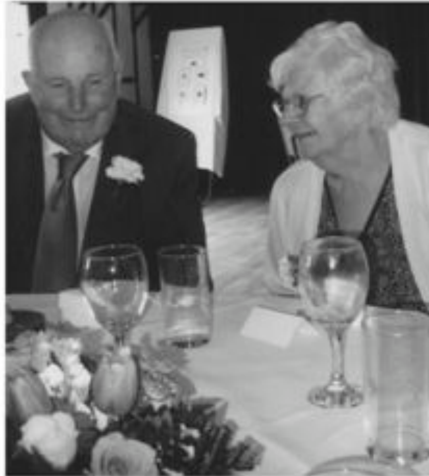
31 May 2008