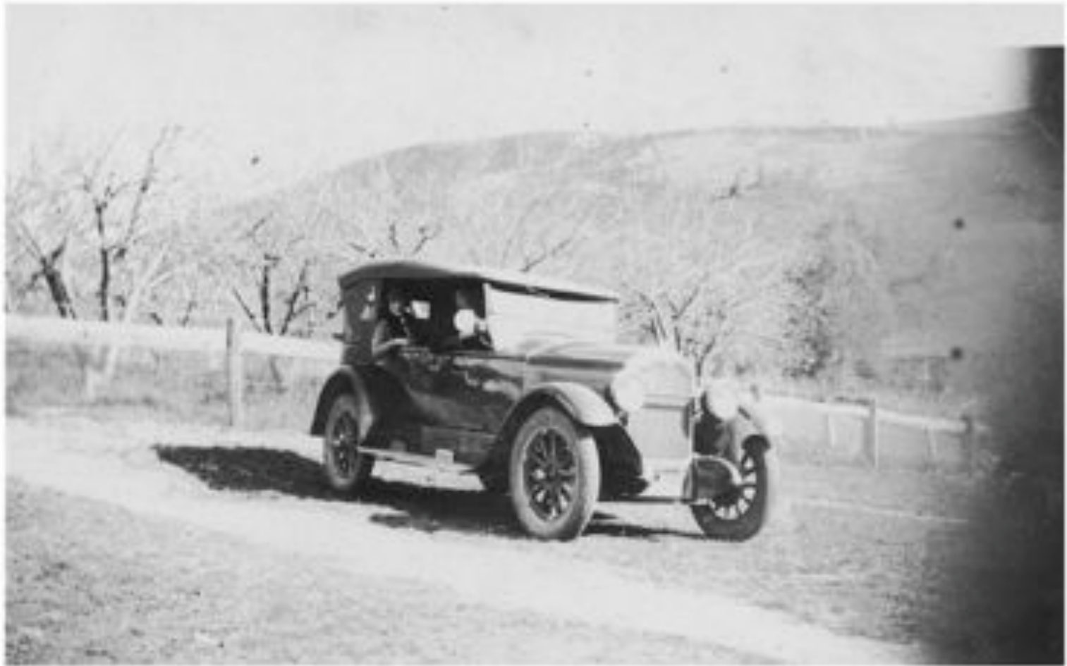
John Angus's first car - 4 cylinder Buick.