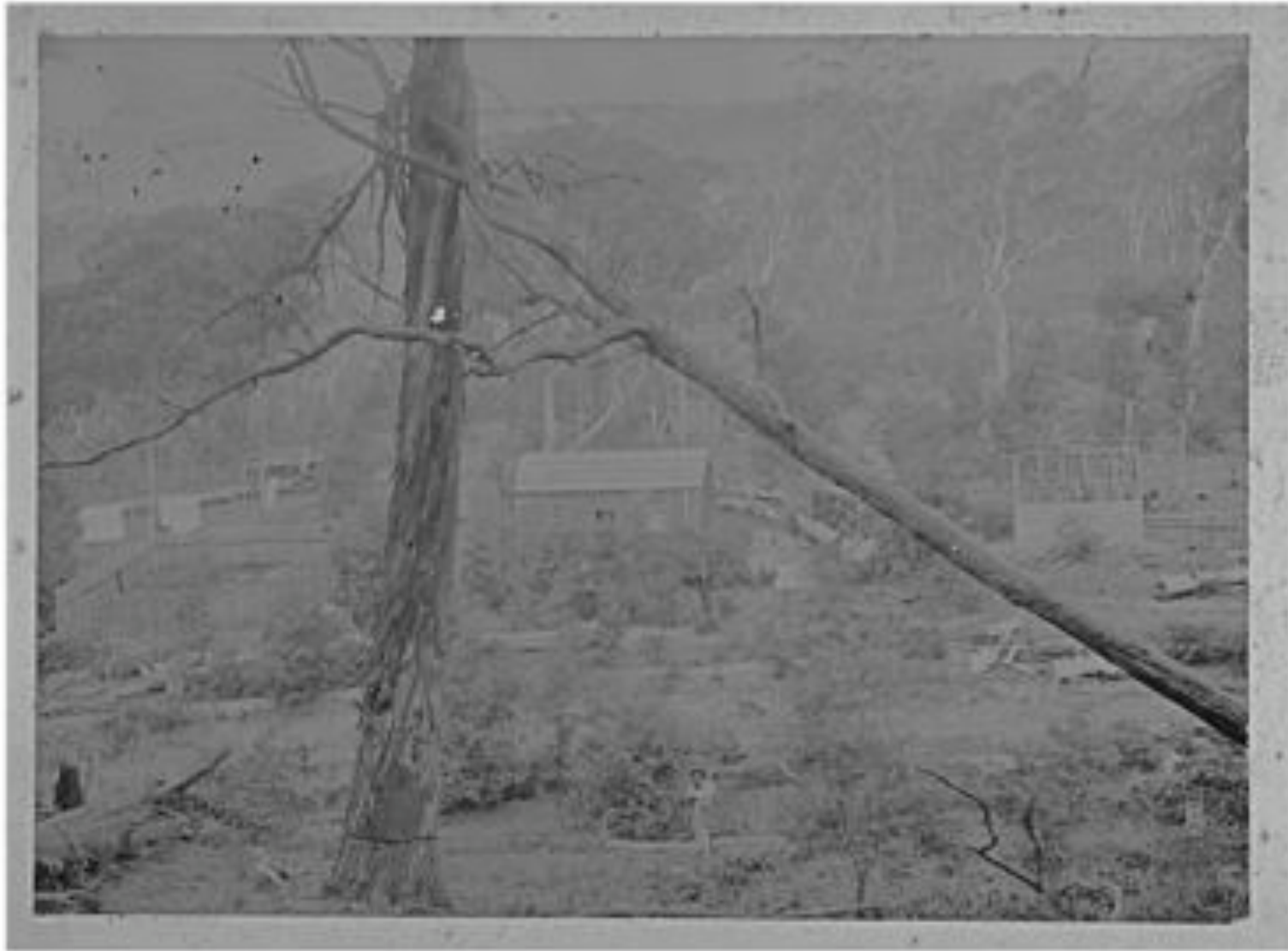
Possibly the first dwelling at Marivale before clearing of the forest had been completed.