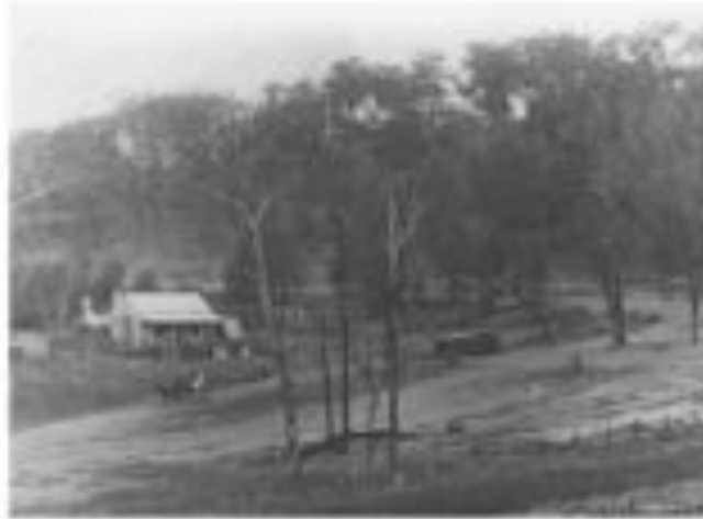
Wattle Circle were Margery Hammond was born.