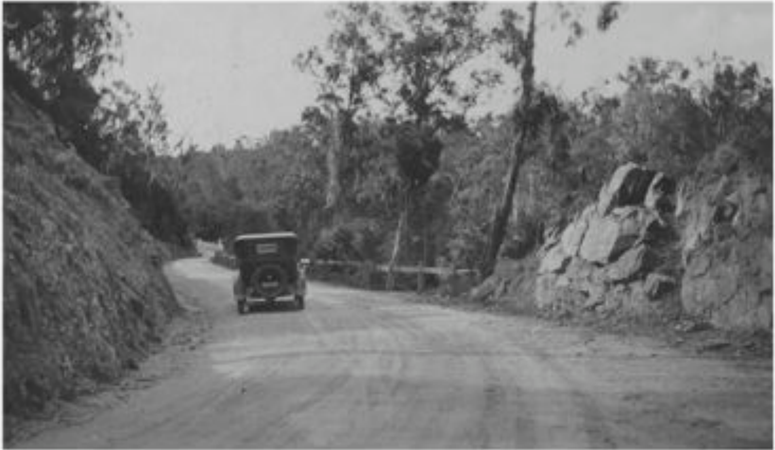
Picture taken just after the road was re-made up the Tambo Valley; about 1928.