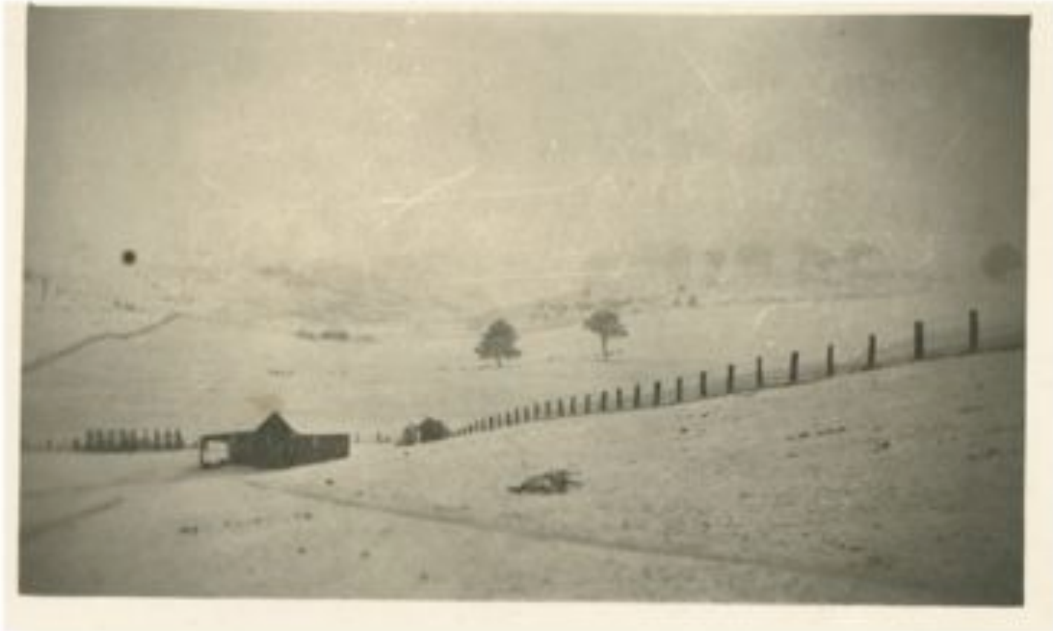
Shed at Marivale in snow.