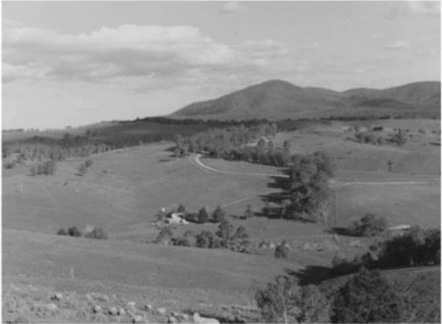
Jim & Ailsa Angus's property at Reedy Flat: "Camp Oven" 1985.